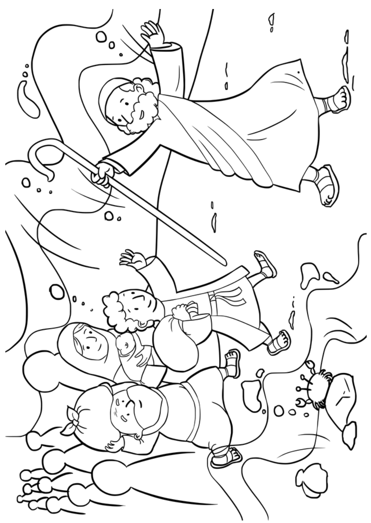
Ndikuyamikani chifukwa kuti chipangidwe change nchoopsa ndi chodabwitsa;ntchito zanu nzodabwitsa;moyo wanga uchidziwa ichi bwino ndithu. Masalimo 139:14