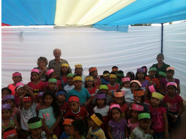
In Chulucanas, 52 children showed up for two days of VBS held in a tent in the streets. The harvest is plentiful!